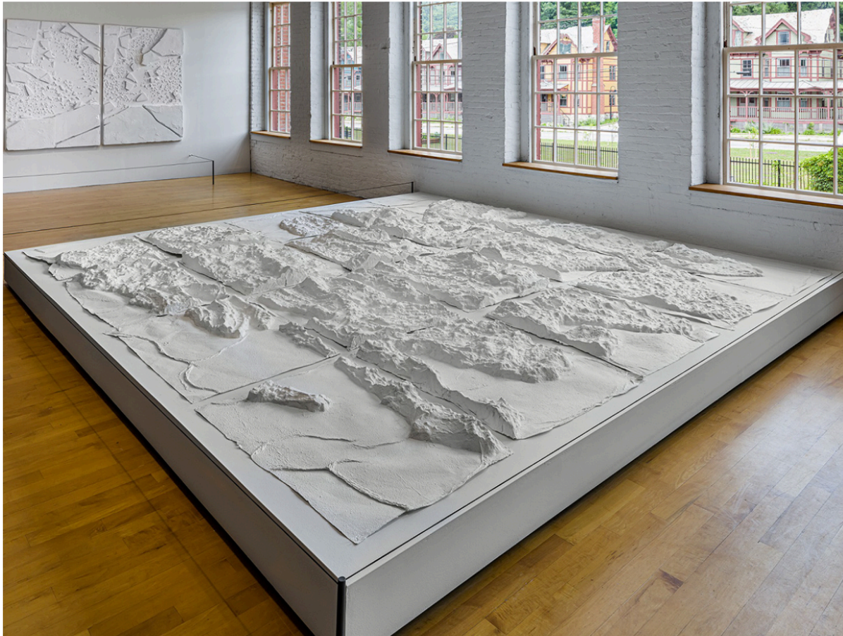
Blane de St Croix exhibition at Mass MoCA